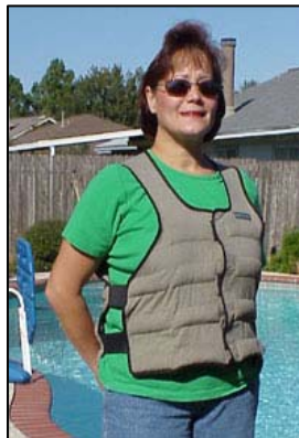
Kit D. Body Cooler – Evaporative